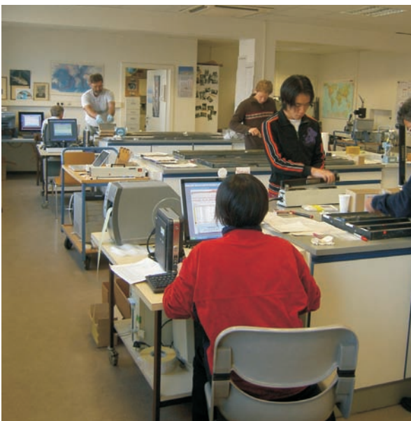
Figure 4. Documentation and sampling of ACEX cores at the former Bremen Core Repository using the ACEX ExpeditionDIS. Several DIS clients were used for the input of visual core description and sample curation data.