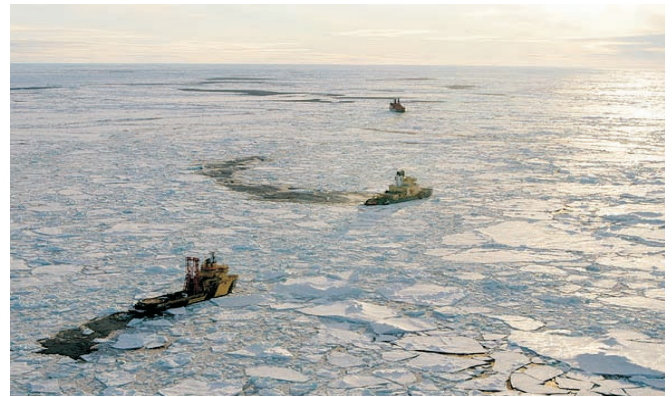
Figure 3. The fleet convoy of Expedition 302 (ACEX). The ACEX ExpeditionDIS was installed on both the drill ship Vidar Viking in front, and the Oden serving as icebreaker and hosting laboratories in the middle, synchronized via a WLAN connection. The icebreaker Sovetskiy Soyuz is in the background.

(French Polynesia). IODP Prel. Rept. , 310, doi: 10.2204/iodp.pr.310.2006.